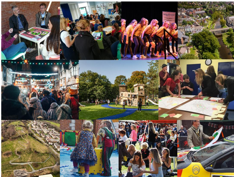
Photo: examples of recent Town Council Work